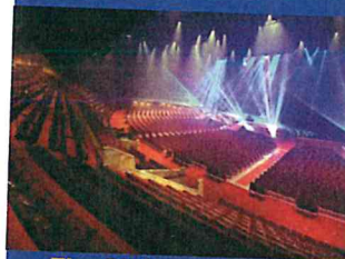
The Sight and Sound Theatre is State-of-the-Art