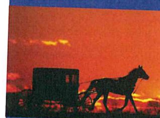
Experience the Amish lifestyle