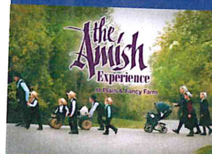
The Amish Experience